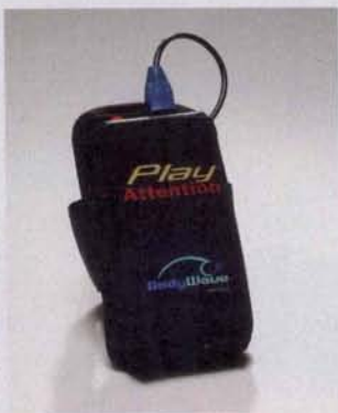
The BodyWave The iPod-size device straps onto your arm